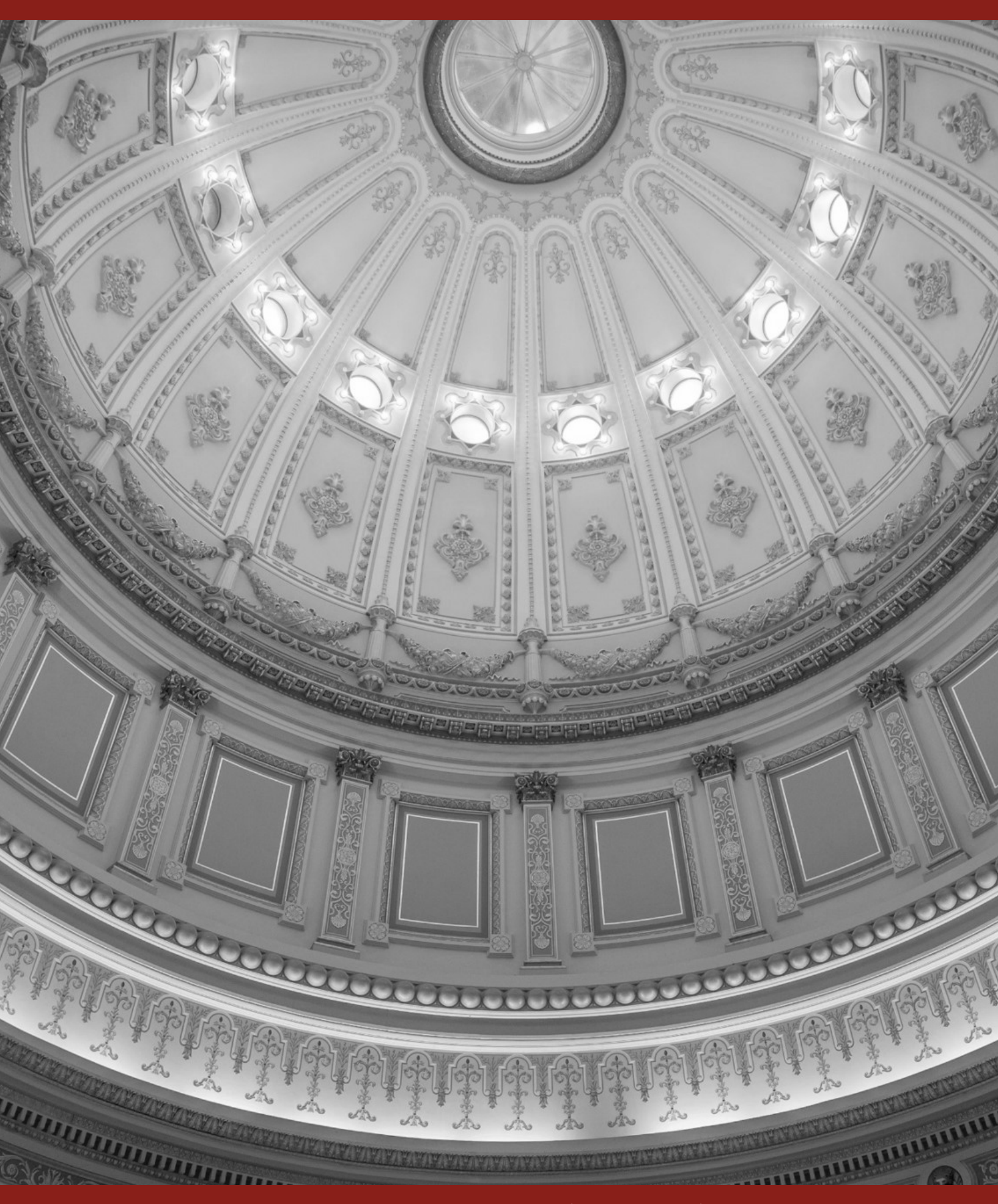
This "manual" is not intended to provide or be a substitute for legal advice. Information provided in the manual is current as of January 2019. Please consult your DWK attorney with questions.